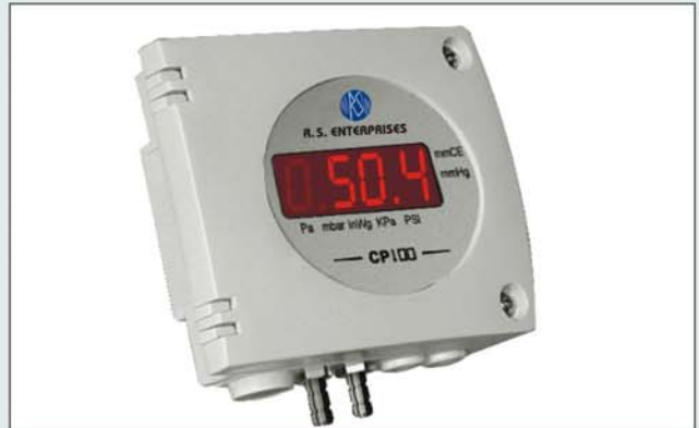
Differential Pressure Type CP100

Range:- 0/100Pa = 1000/2000mbar according to model 0 - 10Vac or 4-20mA outputs, active sensor, Power supply 24Vac/Vdc (3-4 Wire) OR 4-20mA, Passive loop, Power supply 18 - 30Vdc(2 Wire) ABS IP-65 Housing, with or with out Display Quick & easy mounting with the " ¼ turn" System with wall-mount plate Application Area ◆ Pharmaceuticals